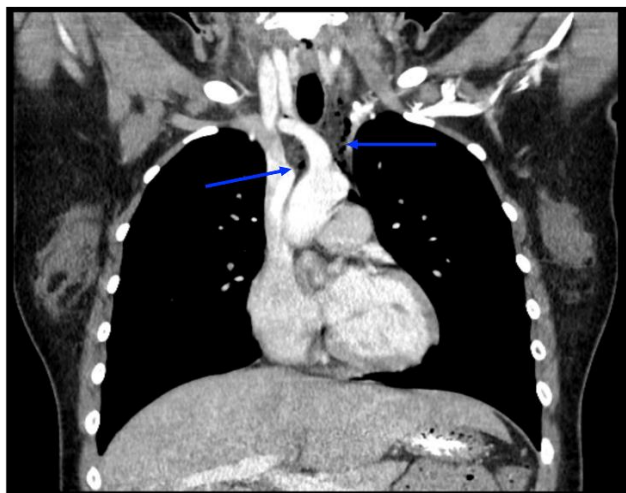
Figure 2. Chest computed tomography (CT) with contrast confirms evidence of pneumomediastinum. Multidetector multiplanar CT images of the chest were obtained after administration of 70 mL iohexol IV contrast material. Foci of air were observed within the anterior and posterior mediastinum tracking up to the thoracic inlet (arrows), consistent with pneumomediastinum. There was no evidence of contrast extravasation; however, small esophageal perforation could not be excluded.

There was no evidence of contrast extravasation; however, small esophageal perforation could not be excluded. This was further confirmed with a fluoroscopic esophageal swallow test using water soluble contrast which showed no evidence of contrast extravasation (Figure 3).